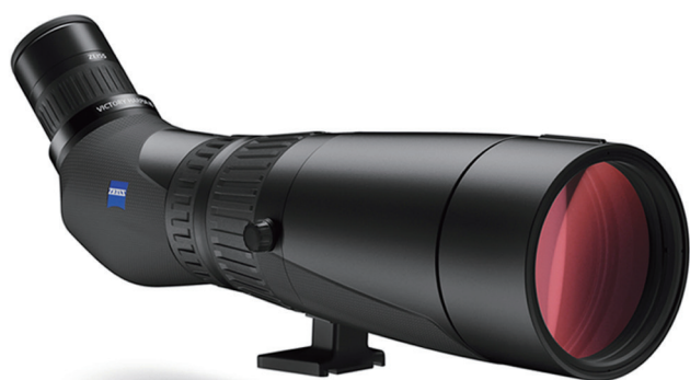
蔡司VICTORY Harpia 85 / 95