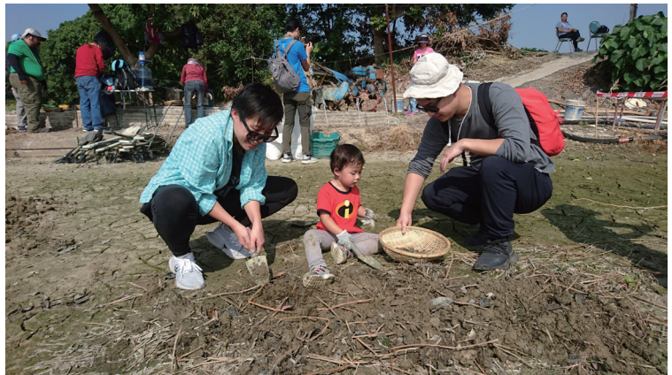
▲ Parents and kid are working hard to harvest Water Chestnut

In the coming April, the first season of paddy rice will be planted. Farming is always not easy because unpredictable weather rules the growth of crops after planting. Let's hope for a productive 2019.