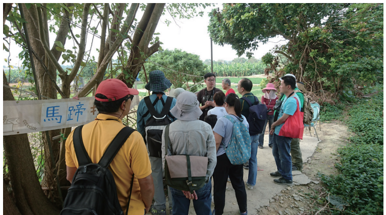
▲ Eco-tour is one of the most popular activities in Harvest Fest.