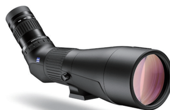
蔡司CONQUEST Gavia 85